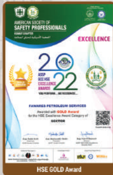
HSE GOLD Award