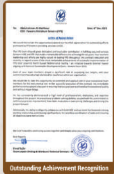
Outstanding Achievement Recognition