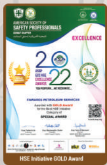
HSE Initiative GOLD Award