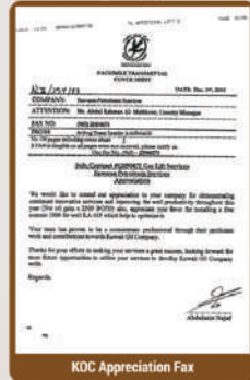
KDC Appreciation Fax