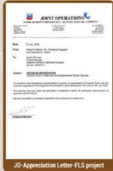
JO- Appreciation Letter-FLS project

FPS continues to be recognized for our performance and reliability. It is a priority to identify and adopt international laws and regulations that demonstrate our commitment to providing the highest quality of performance and reliability to our clients and employees. We utilize the FPS Ethics and Code of Conduct to show accountability, build trust and innovate. This can be evidenced by receiving Certificates of Recognition and Certificates of Excellence from the following.