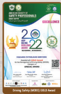
Driving Safety (MODS) GOLD Award